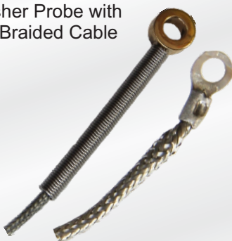
Washer Probe with SS Braided Cable