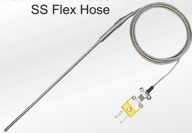
Cable with Protective SS Flex Hose