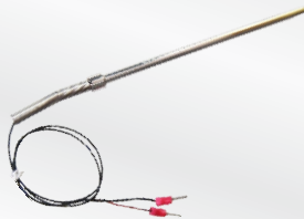
With PTFE/PTFE Cable