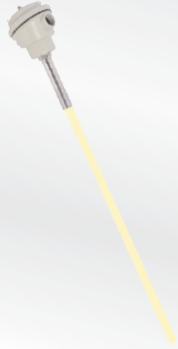
RCA Sheath for High Temperature