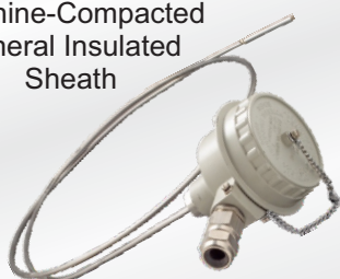
Machine-Compacted Mineral Insulated Sheath