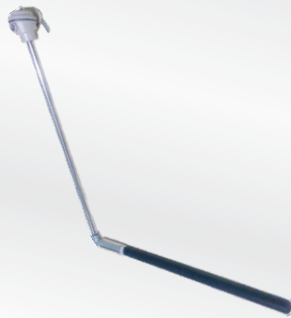
Silicon Nitride Sheath for Casting