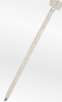
Ceramic Beaded for Muffle Furnace